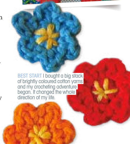
BEST START I bought a big stack of brightly coloured cotton yarns and my crocheting adventure began. It changed the whole direction of my life.