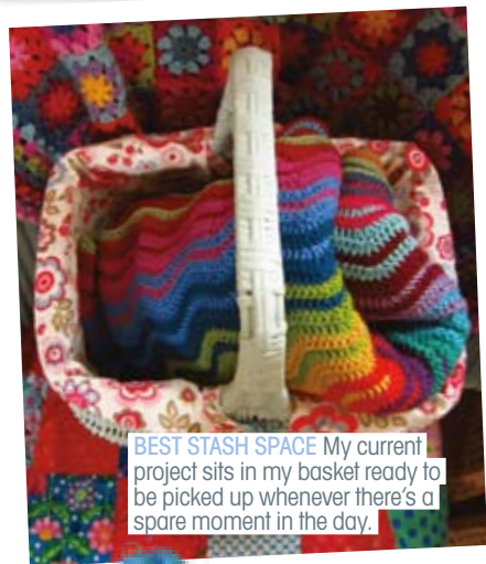
BEST STASH SPACE My current project sits in my basket ready to be picked up whenever there's a spare moment in the day.