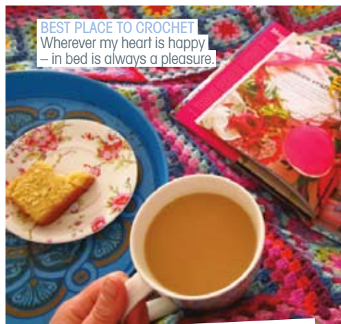
BEST PLACE TO CROCHET Wherever my heart is happy – in bed is always a pleasure.

BEST DISTRACTION My blog keeps me pretty busy! www.attic24.typepad.com .