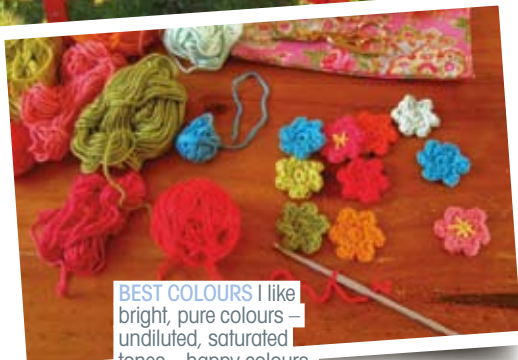
BEST COLOURS I like bright, pure colours – undiluted, saturated tones – happy colours.